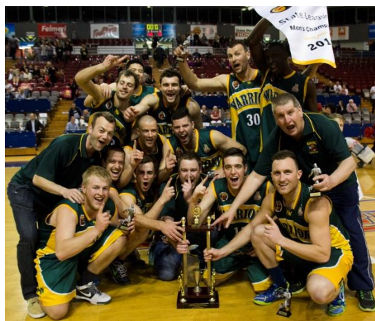
Woodville Warriors Men

Basketball SA's premier competition, the Central ABL, ran from March to August in 2014. The 2014 Grand Final was held at the Adelaide Arena and was attended by approximately 2,000 spectators. Following are the results and notable achievements from the 2014 season.