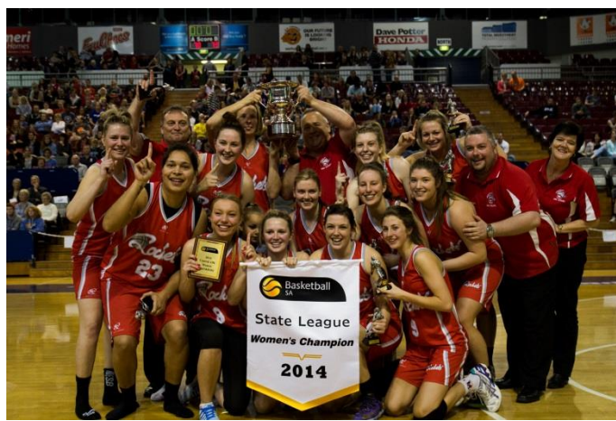
North Adelaide Rockets Women