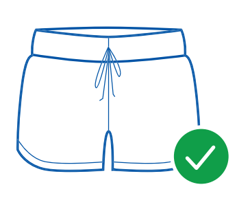
Shorts 90% prefer to wear shorts during school sport, 94% prefer to wear shorts during sport outside of school

Girls have a strong preference for clothing that helps them perform at their best during school sport and sport outside of school.